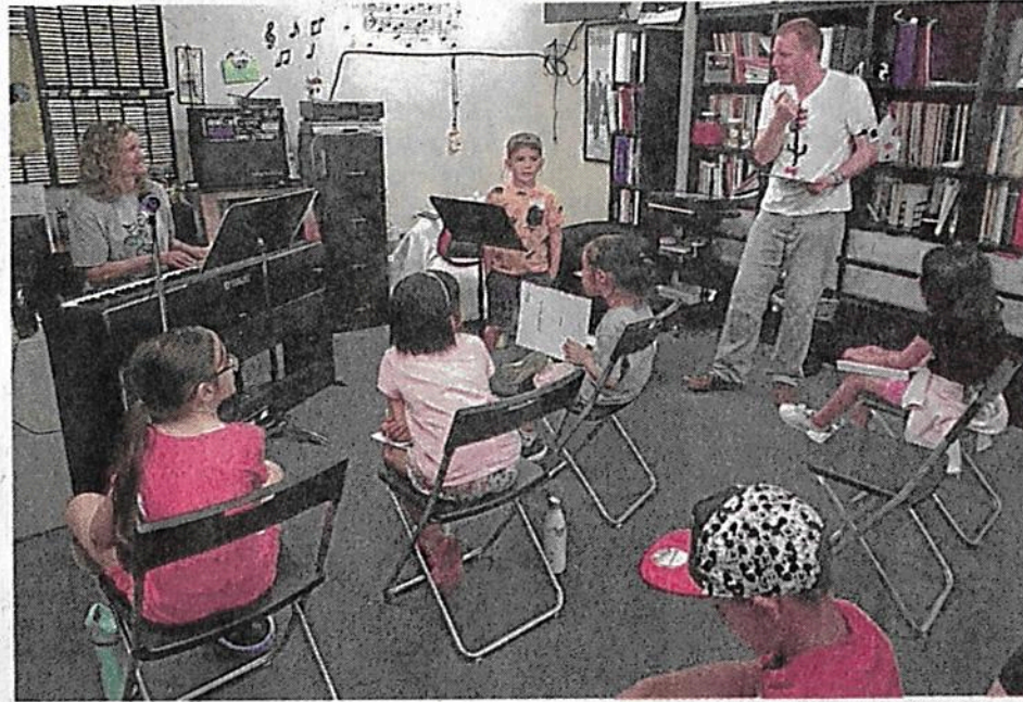
SAGUARO CITY MUSICAL THEATRE

She and her colleagues are gratified by the momentum they have built.